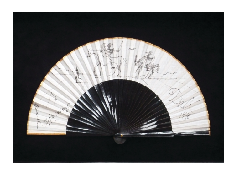
TRADITIONAL FOLDING FAN

The two types of fans made during the workshop are illustrated below: